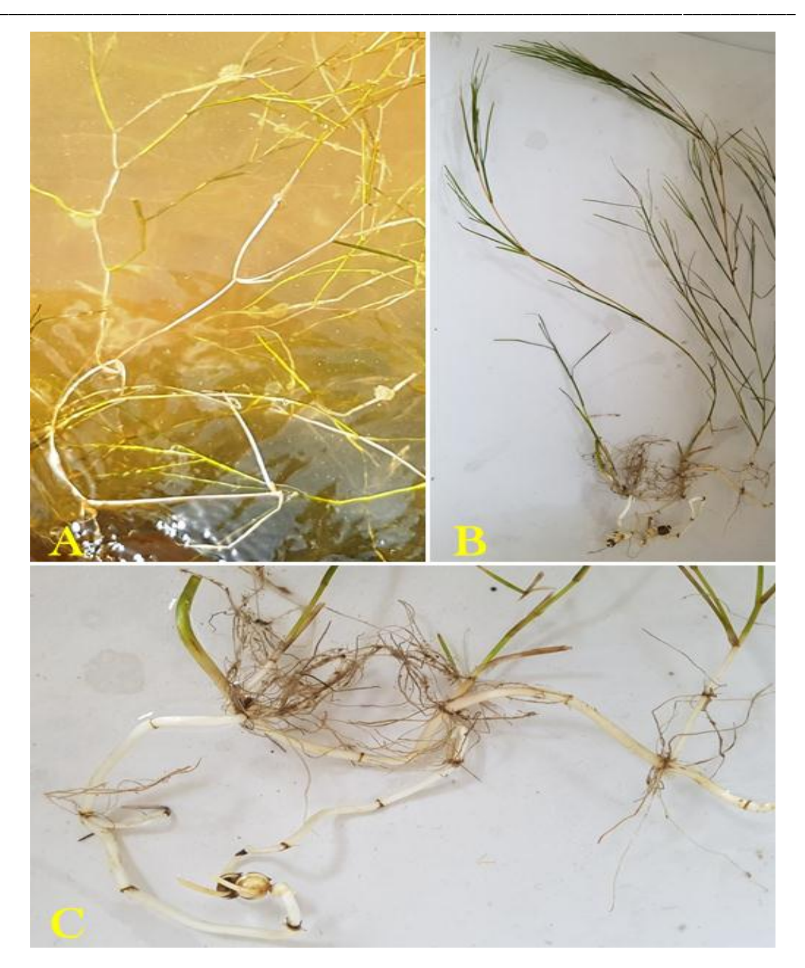
Fig. 2- Stuckenia pectinata (A-C): A. Submerged plant; B. Whole plant showing distichous arrangement of liner leaves; C. Rhizomes bearing roots and tubers.